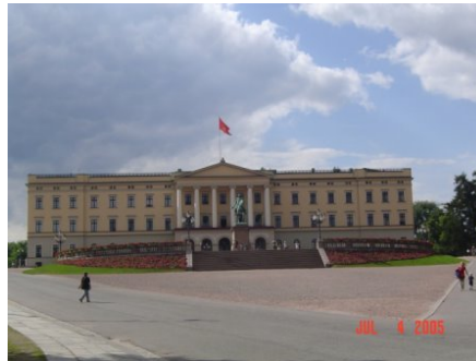
The Royal Palace in Oslo, Norway